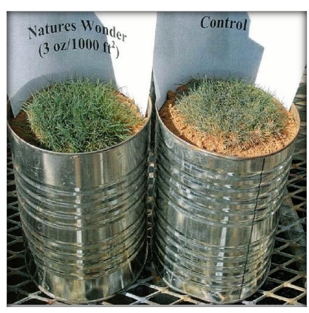
Above: Plugs mowed to 3/8" and pulled, soil & roots cut to thatch layer, let acclimate for 2 weeks. Plugs were then placed in the sun for 3½ weeks without irrigation.