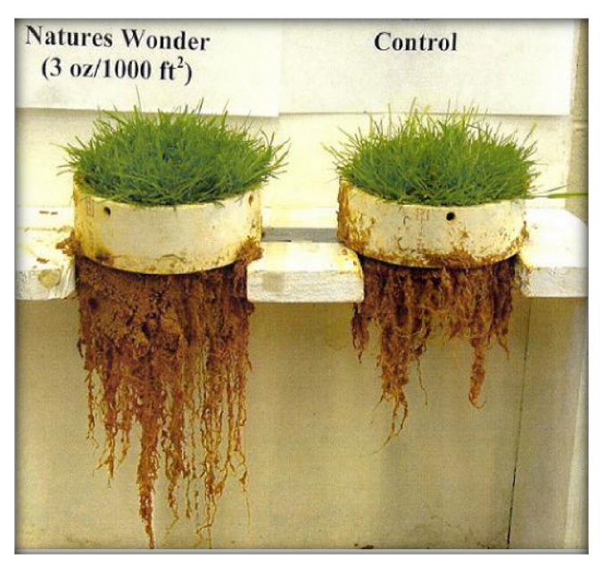
Above: Plugs mowed at 3/8"and pulled after 3½ months. Plugs were grown in the field with proper rates of fertilizer and irrigation applied.